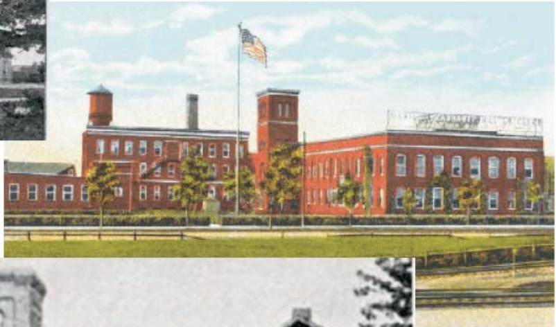
Carhartt Mills operated in the early 1900s.