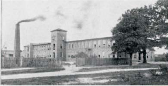
The Cottony Factory was originally built in 1881.