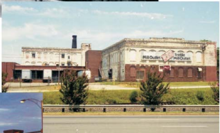
Ostrow Warehouse oper- ated in the in the early 1970s until closed n 2001.