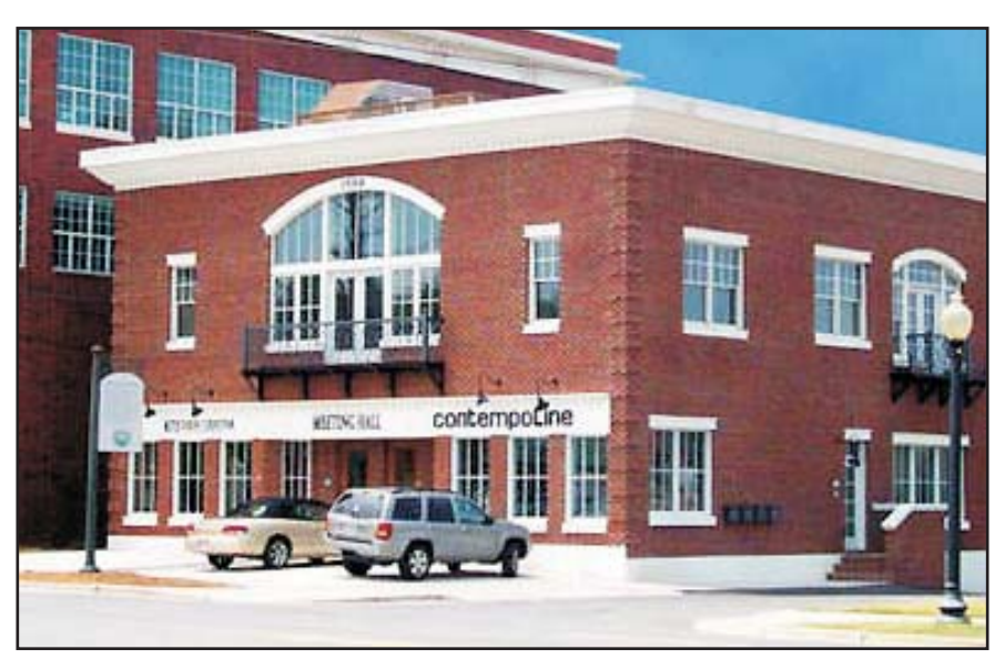
Architect: Narmour Wright Creech Architecture Charlotte, NC